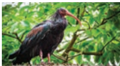
Chefchaouen, Morocco and Northern Bald Ibis

A winding stepped alleyway with flowerpots in Chefchaouen, where the buildings of the Medina or old town are painted in shades of pale to bright blue, a tradition started by Jewish immigrants in the 1930s. This attractive city, founded in 1471, has narrow lanes converging on the kasbah or fortress and the large central square, set against the striking backdrop of the Rif Mountains. Most of the endangered northern bald ibis remain in Morocco.