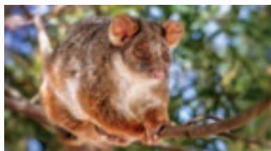
These dramatic limestone sea stacks formed by erosion stand offshore in the Port Campbell National Park, though there are only eight remaining. Pristine sandy beaches framed by steep cliffs, arches, caves and blowholes created by erosion by the wind and the ocean are a feature of the coastline along the Great Ocean Road, a breathtaking scenic highway. Ringtail and brushtail possums are small nocturnal marsupials that can be seen in the trees nearby.

Twelve Apostles, Victoria, Australia and Possum