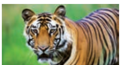
Taj Mahal, Agra, India and Bengal Tiger

Sublimely reflected in the pool, this inspiring monument was built between 1631 and 1654 by thousands of artisans for the Mughal Emperor Shah Jahan as a mausoleum for his dead wife Mumtaz Mahal. Blending Islamic, Indian, Turkish and Persian elements, it is built entirely of white marble, decorated with precious gems, with a huge central dome. The Bengal tiger is found all over India and is one of the world's largest and most awesome predators.