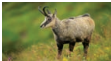
In the foothills of Mont Ventoux where Chamois can be seen on the steep slopes, the peaceful hill village of Aurel with its picturesque narrow streets and squares is surrounded by immense fields of lavender. It has inspired artists for centuries for the quality of its light and the colours of the purple lavender and golden corn fields. The 12th century church is crowned by a square bell tower and there are the remains of a 12th century château.