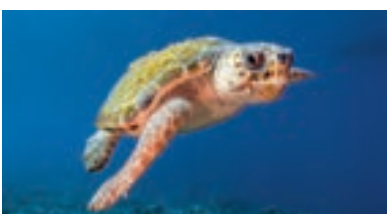
Amalfi, Italy and Loggerhead Sea Turtle

On a dazzling stretch of coast with dramatic grottos, cliffs, shimmering bays and small villages perched between the mountains and the sea, Amalfi lies at the mouth of a deep ravine. It was a major Mediterranean maritime trading power from 839-1200 and later a popular early 20th century winter resort. The Amalfi coast is famed for its cultivation of lemons and production of Limoncello liqueur. Loggerhead turtles surround the waters off the coast.